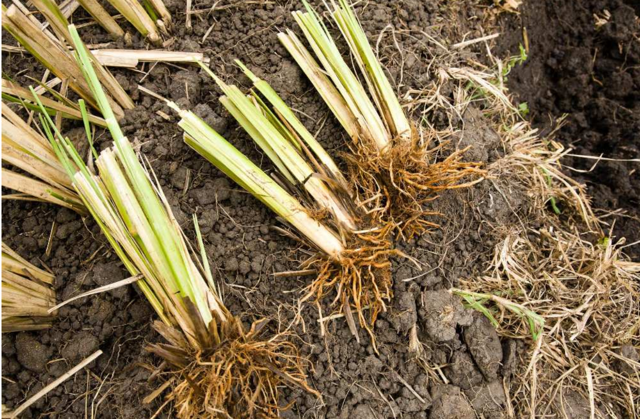
Figure 5: Slips soaked for 4 days are showing new root growth.