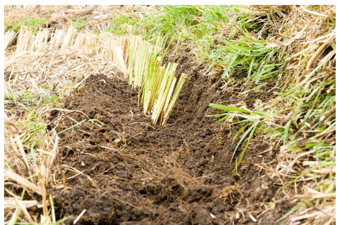
Figure 8: Shape of flattened terrace. Irrigated water should not run off. Excessive rainfall may.