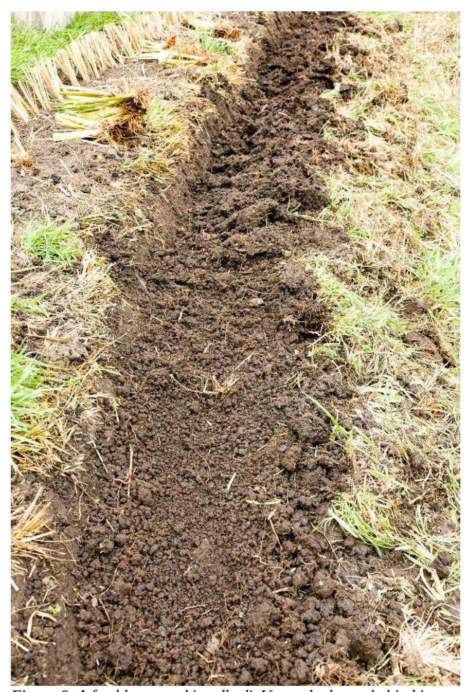
Figure 6: A freshly created 'seedbed'. Untouched area behind it.

After sieving the soil and, if possible, breaking up some of the clods, a flat 'seedbed' is created of loose, friable soil. This is visible below. This step is not necessary but it does remove any unwanted plants and makes planting the slips easier to pack soil around the roots to prevent air gaps.