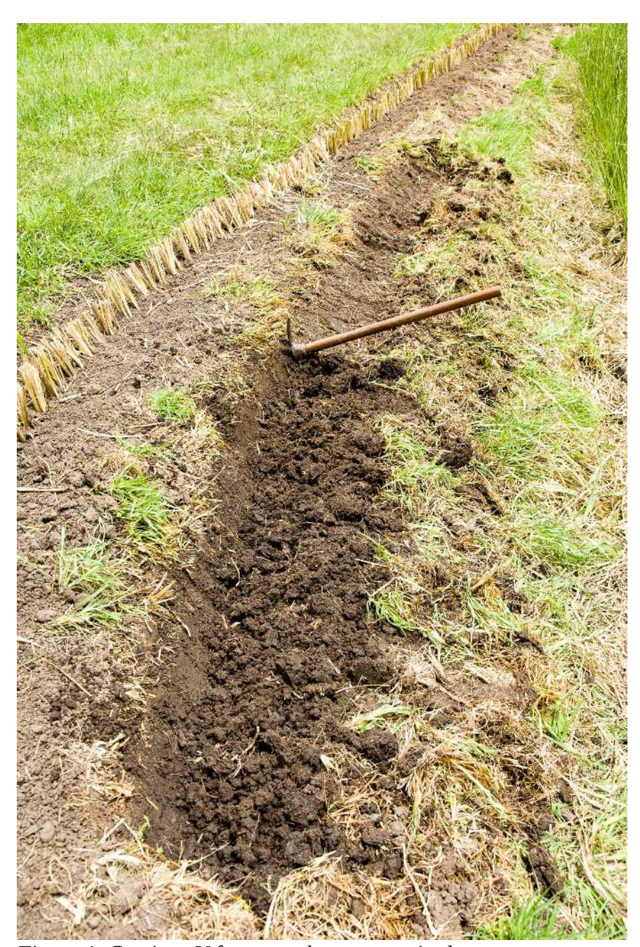
Figure 4: Continue V-furrow as long as required.