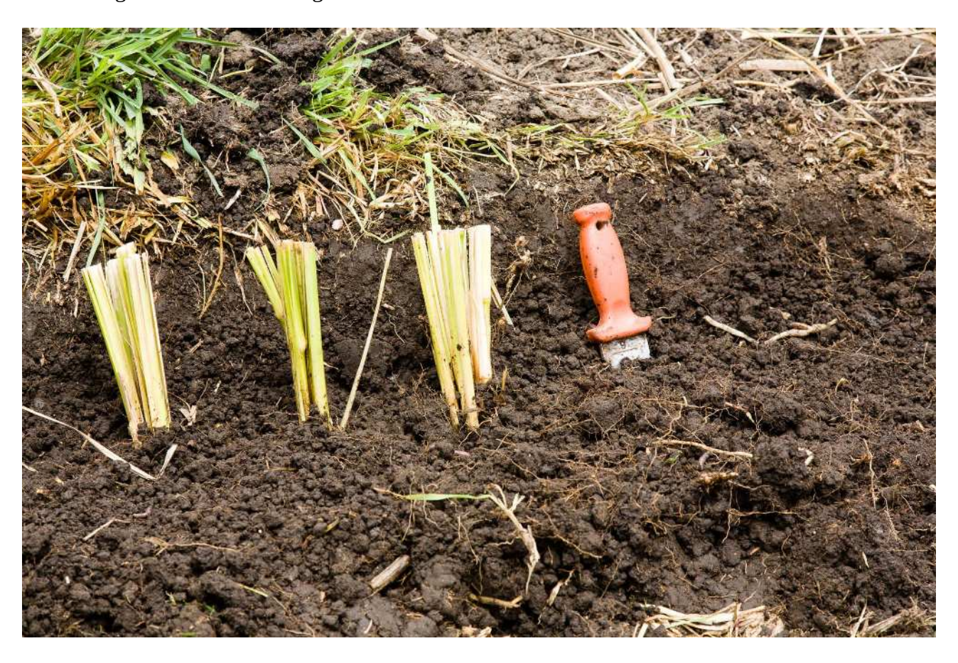
Smaller non-standard slips (one tiller) can be grouped together as below, or added to other slips.

Using a knife, small mattock, or trowel can help start a hole when fingers cannot penetrate the soil when using the back batter as a guide.