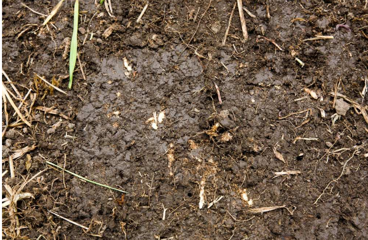
Figure 3: Setaria Grass crowns still visible in soil after hoeing.