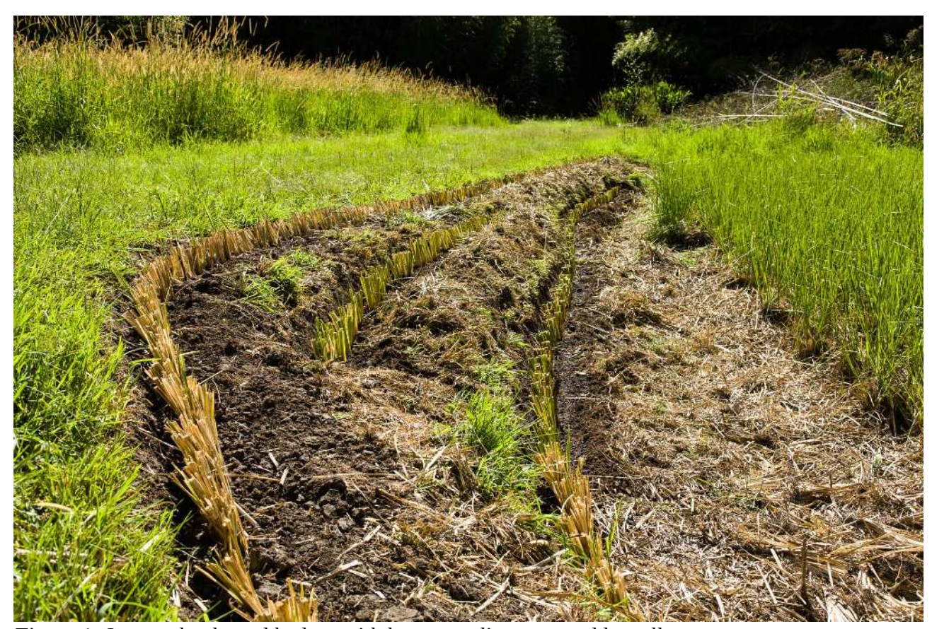
Figure 1: 3 recently planted hedges with bareroot slips on a paddy wall.

This document is a pictorial guide to one method of planting Vetiver Grass as described in the Vetiver System. For further information on other planting applications, please visit the <u>Vetiver Website</u>. For updates and discussion, use the <u>Vetiver Blog</u>, <u>Vetiver Facebook Group</u>, or <u>Vetiver Forum</u>.