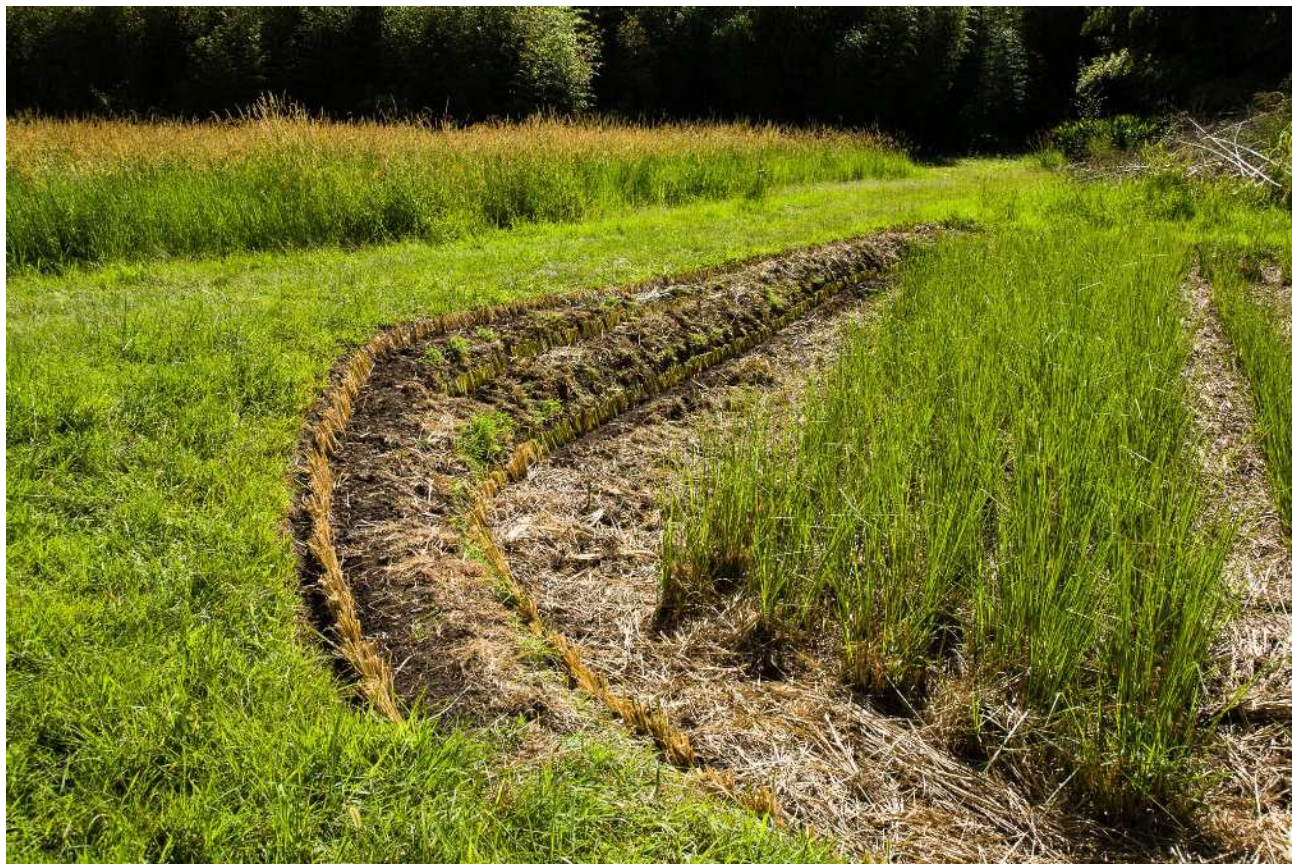
Figure 9: Almost completed paddy wall. The shorter middle hedge is to reduce the distance between top and bottom hedge for better suppression of bank through shading.

For more information about Vetiver you can visit my site, <u>Erosion QLD</u>, or access the <u>Propagation Guide</u>, or <u>Frequently Asked Questions</u>. Thank you.